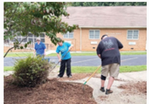
Staff prepares grounds for the Open House

Guests were welcomed with guided tours of the campgrounds, opportunities to learn more about NCLF's mission, and a chance to see firsthand the impact of programs like Brighter Visions and the Camp Dogwood Raffle. The atmosphere was filled with excitement, curiosity, and heartfelt conversations about the future of the Foundation.