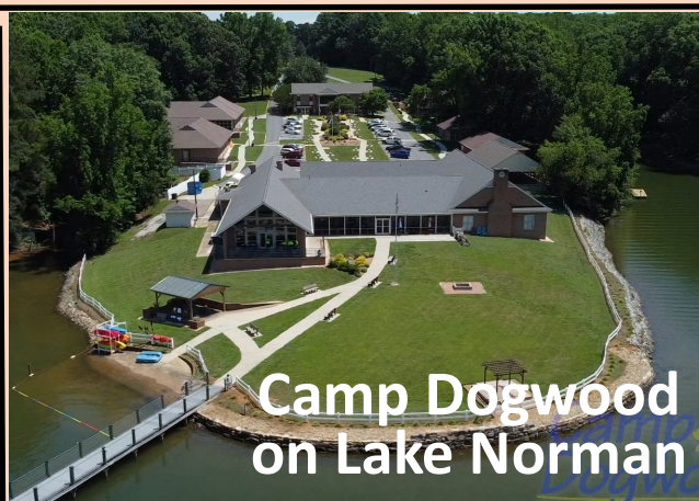
Camp Dogwood on Lake Norman